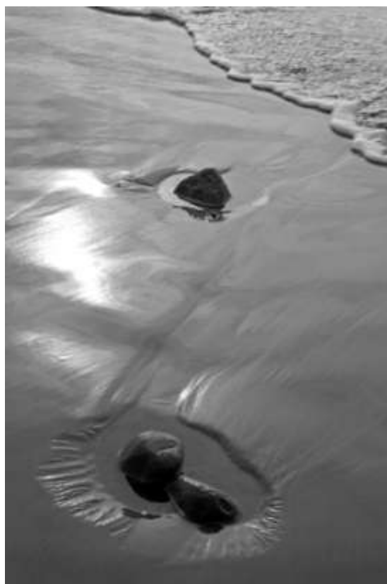
Third PLACE: Lisa Franklin

Comments: Image is good. Composition is good. Lighting is very good. Love the simplicity! Best in B&W like diagonal. composition-animated corners, excellent clarity and balance of light and shadow. Beautiful picture, but nothing about it identifies it as being taken on the edge of SF Bay. Interesting look, the sand looks liquefied, creative. This is a clean, nicely composed and visually balanced black and white image with a full range of values and a nice mix of shapes and textures formed by the surf, sand and rocks on the beach. Very serene capture.