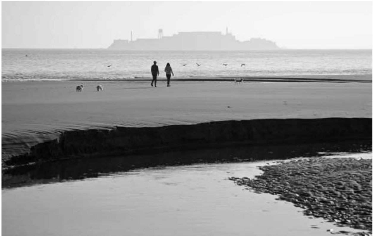
FIRST PLACE: Tom Donahoe

The winners of the “ Edge of the Bay ” Contest are: