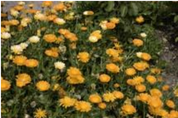
Using Live View (Mirror Locked Up)