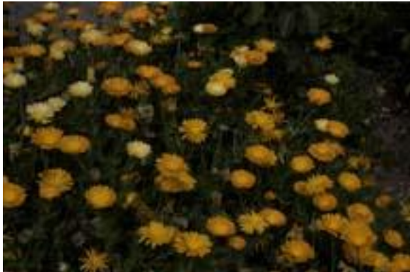
View Finder Not Covered