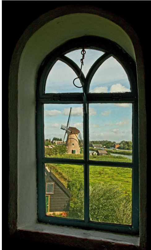
FIRST PLACE: Tom Donahoe

The winners of the January Photo Contest (“Windows & Doors”) are: