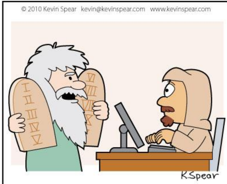
"I want you to scan these and put them in the next newsletter."