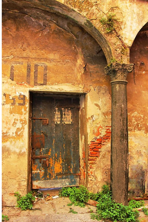
SECOND PLACE: Mike King

Comments: Beautiful colors and patterns in the peeling paint and plaster. Nice composition, color and lighting. One can almost feel the texture on the walls and door. Would personally like a little less saturation on the greenery.