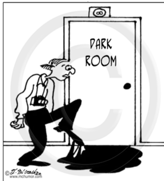
“Damn. The dark is leaking out of the dark room again.”