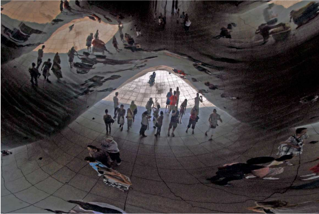
SECOND PLACE: Linda Wilcox

Comments: Love that the reflection is less abstract than the reflecting subject. Liked the way the photo was seen.