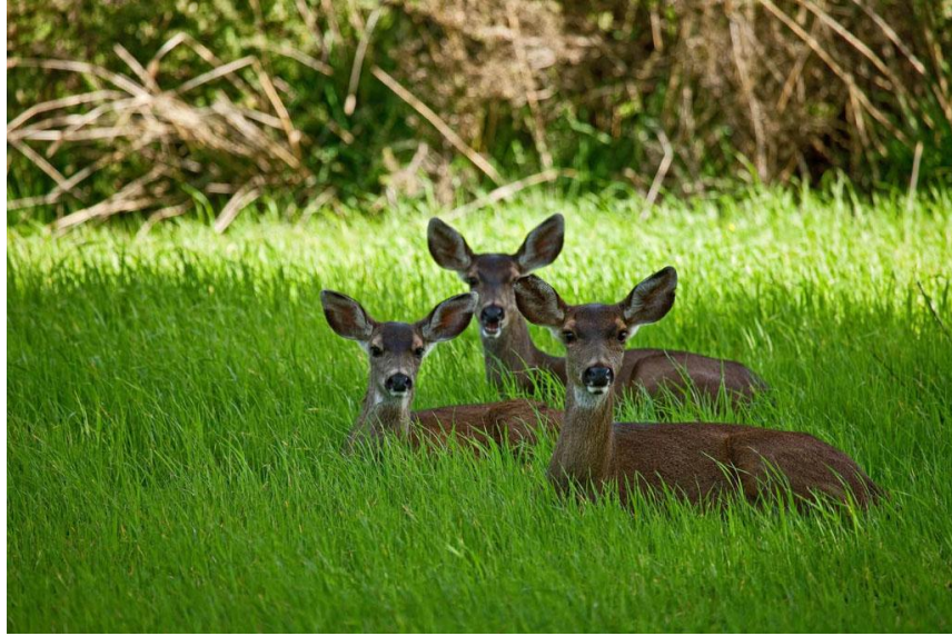
SECOND PLACE: Tom Donahoe

Comments: Pretty composition and capture of the deer's' identical poses. They look like statues. Wonderful composition; love the pattern made with the 3 "Y's" of neck/head/ears. I like the line of light between ground and background brush, pushing the deer forward. Humorous triad, Sharp, accurate color. The arrangement of the deer against the emerald green grass is very pleasing. Would be better if not right in the center.